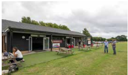
Broomfield FC (Chelmsford CC's new meeting venue)

submissions earlier than usual, deliver them in a safe fashion to the judge so the prints can be quarantined and the evening is run with a PDI of the original print where the judge provides his commentary. The prints then need to be collected using the same safe principles. Whilst a bit of a palaver, the judges have really commented well and appreciated the ability to pore over the printed form. What a virtual meeting has allowed is for speakers from well beyond our natural geography to present to us, and this has definitely had a positive impact, with speakers from beyond our borders presenting their imagery and techniques all of which would not have been considered pre COVID. To round off, a friendly but competi-