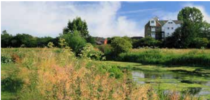
Moulsham Mill (Chelmsford CC's former meeting venue)