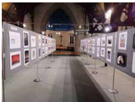
St Ives Interprint 2024 - see page 23 for a full report.

Annual EAF Exhibition in Bury St. Edmunds