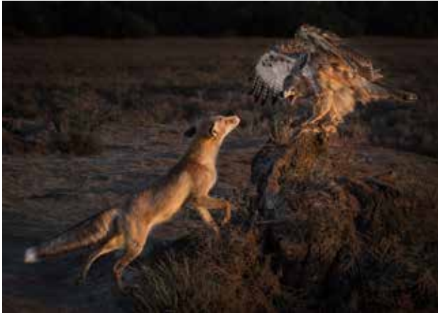
Left: 'Bonnelli's Eagle Fights Off Iberian Fox'.