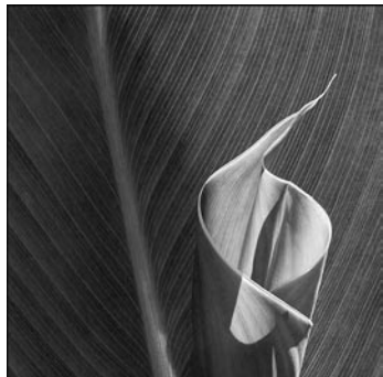
Plant detail